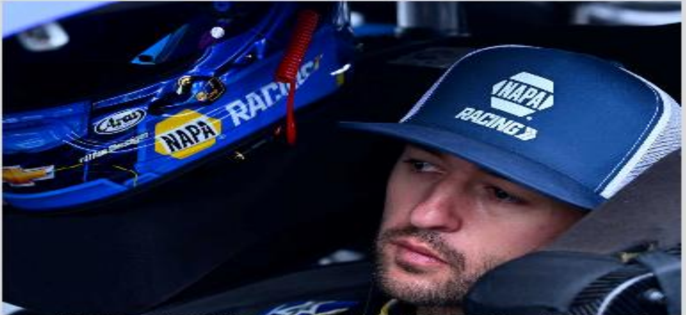
Chase Elliott sits in the No. 9 NAPA Auto Parts Chevrolet during NASCAR Cup Series qualifying at Dover Motor Speedway on Saturday.